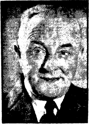
SIR ARTHUR MASSEY

Included in an extensive programme prepared by the